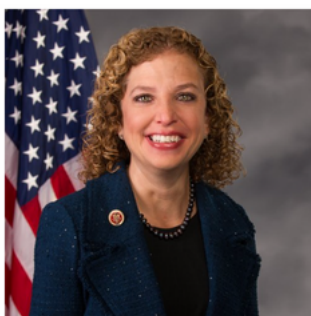
Honorable Debbie Wasserman Schultz

Member of Congress, 23rd District of Florida U.S. House of Representatives